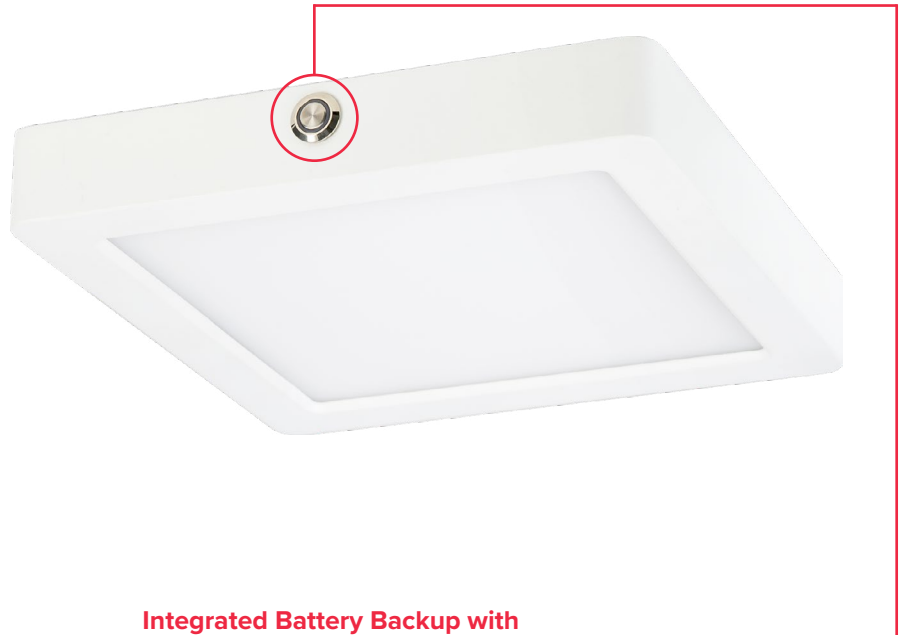
Integrated Battery Backup with Easily Replaceable Quick Connect Battery